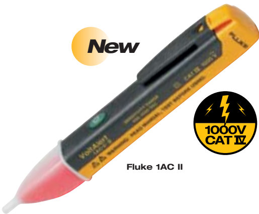
Fluke 1AC II

7-600 Battery life: Alkaline, 650 hours continuous, sleep mode Size (HxWxD): 142.3 mm x 70.5 mm x 34.6 mm Weight: 0.286 kg Two year warranty